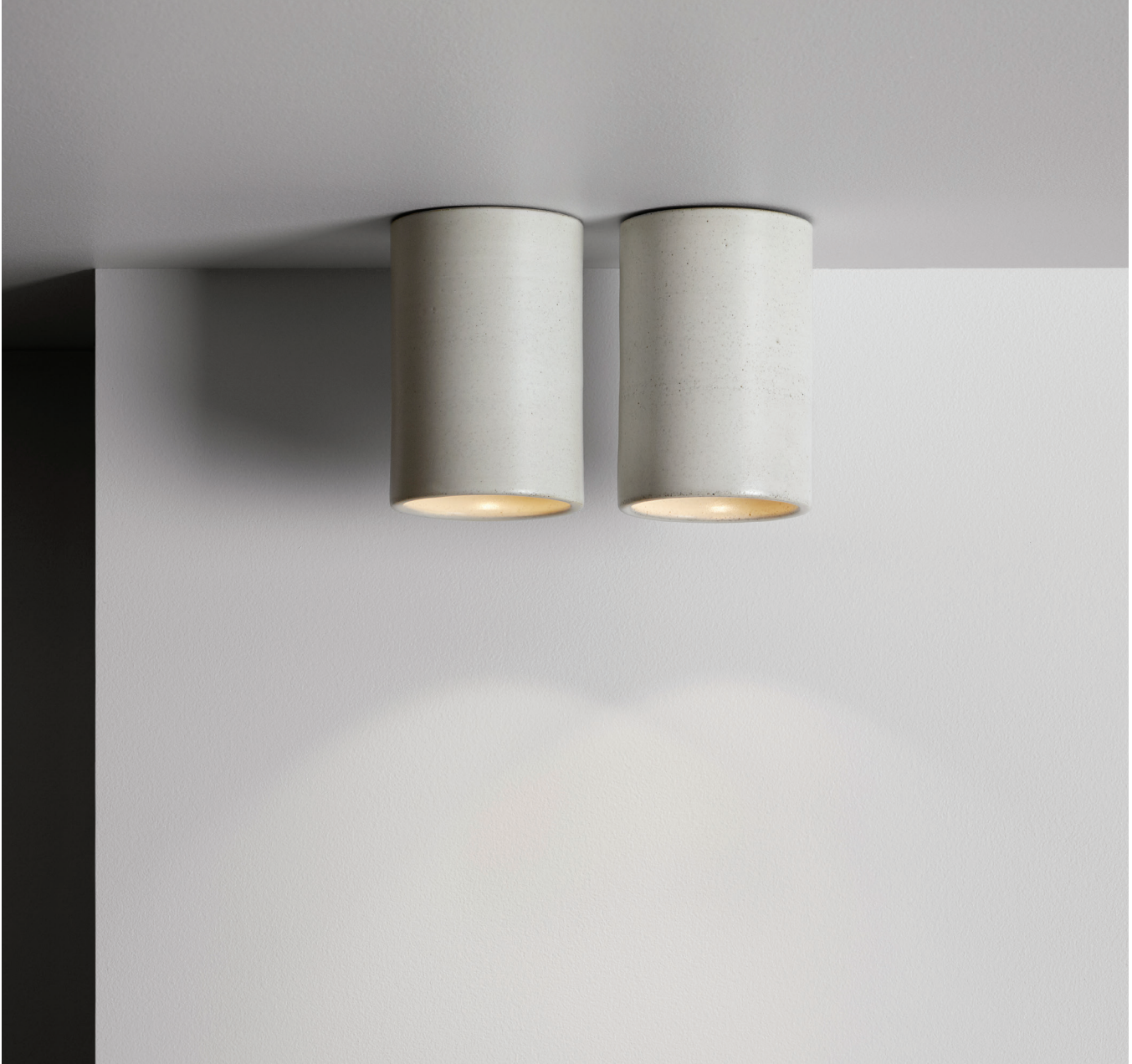
Earth Light, ceiling mount, regular –Speckled White Satin

The Earth Light has been designed in wall, pendant and ceiling mount formats. The elemental geometric form is both simple and architectural; all fittings are thrown on a potter's wheel giving each light a unique quality and a surface rich with the evidence of its handmade process.