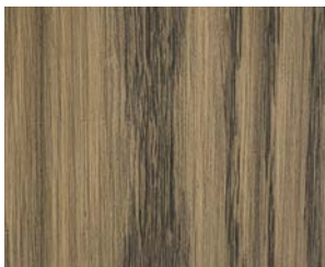
// whiskey (stain)