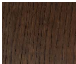
// walnut (stain)