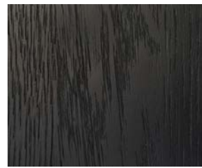
// true black (stain)