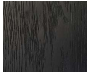
// true black (stain)