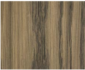
// whiskey (stain)