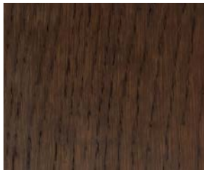
// walnut (stain)